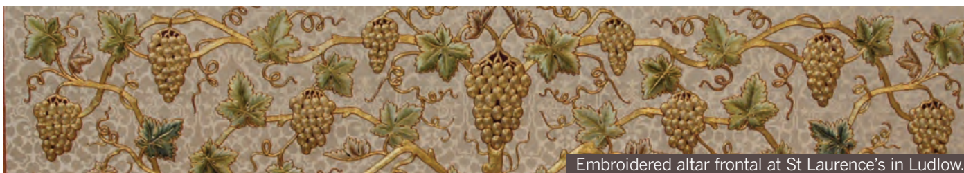
Embroidered altar frontal at St Laurence's in Ludlow.