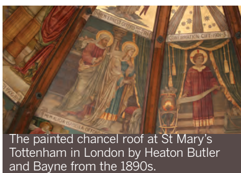
The painted chancel roof at St Mary's Tottenham in London by Heaton Butler and Bayne from the 1890s.

All donations to the ChurchCare Fund (legally established as the Anglican Parish Churches Fund with Charity number 1148066) are spent directly on the conservation of treasures. There are no administrative charges.