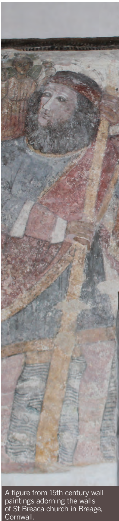
A figure from 15th century wall paintings adorning the walls of St Breaca church in Breage, Cornwall.

display. A report is nearing completion.