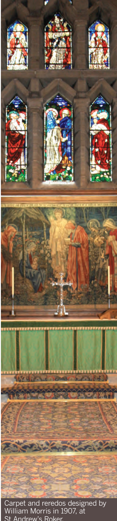
Carpet and reredos designed by William Morris in 1907, at St Andrew's Roker.

Our £3 million appeal to protect 100 artworks identified as most in need of conservation continues. For further details of the campaign visit www.churchcare.co.uk/about-us/campaigns/our-campaigns/100-church-treasures